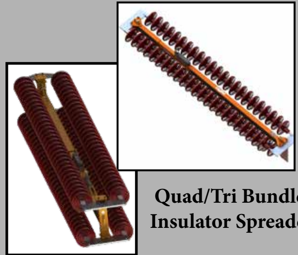
Quad/Tri Bundle Insulator Spreader