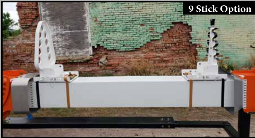
9 Stick Option

Designed to fit 2 person bucket trucks with a square boom. The rack can hold up to 10 sticks of various configurations within easy reach to the operators.