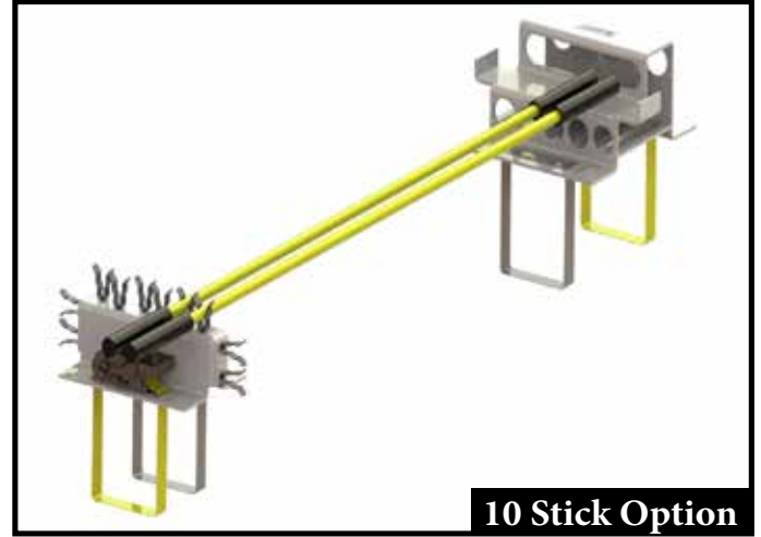
10 Stick Option

Designed to fit the Versalift SST-37-EIH single person bucket truck to allow 2 hot sticks such as a switch stick and a shotgum stick to be carried up into the work area out of the way but accessible to the person in the bucket