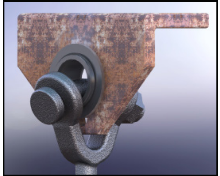
Buddy Bushing with hardware